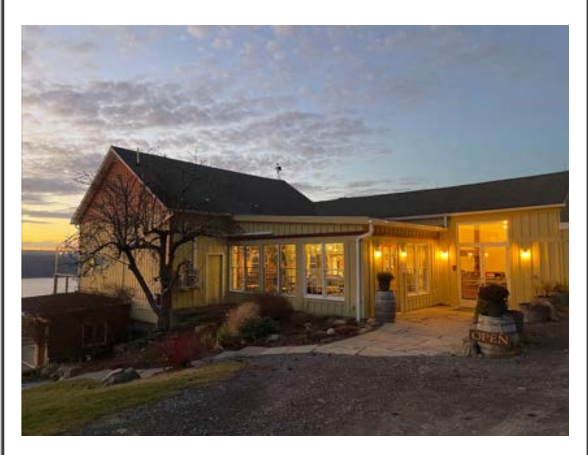
Winter Hours Begin January 2

Please note that our winter schedule will begin Tuesday, January 2. We look forward to seeing you Thursday through Monday from 11:00 a.m. to 5:00 p.m.